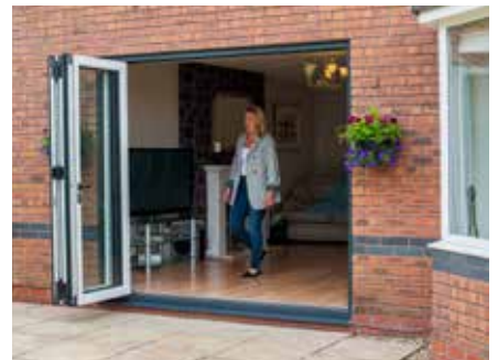
The Imagine Bi-Fold Door makes an attractive alternative to a traditional sliding patio door; completely opening your home up to the garden or patio.